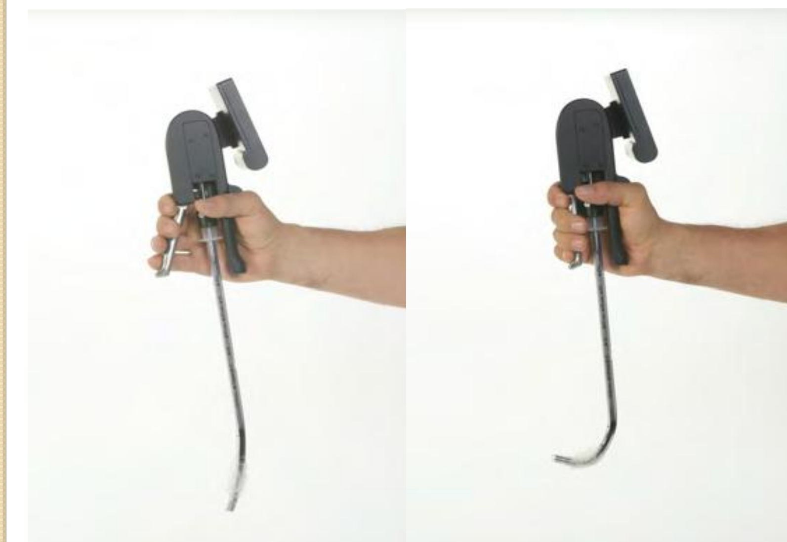
Figure 1 - video RIFL® extended (L) and flexed (R)

With a stylet-based approach the displacement of the patient's tongue to allow visualization of the larynx is very important. One technique to create this space is to use a Macintosh laryngoscope blade along with a stylet. The objective of this retrospective review was to examine the use of the Video RIFL alongside direct laryngoscopy. In a scenario in which the user was unable to obtain a view of the glottis using a Macintosh laryngoscope blade, the Video RIFL could be used to navigate past any obstruction, thus enabling successful intubation. The user would not need to remove the metal blade and insert an additional modality but could use the articulating video stylet to complement the blade.