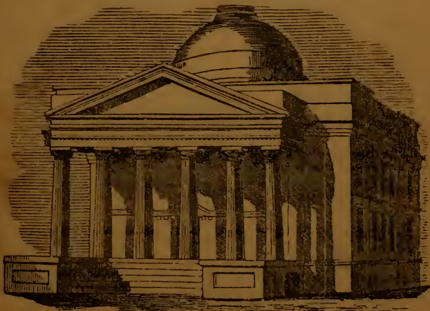
MEDICAL COLLEGE OF GEORGIA.

DEMONSTRATOR OF ANATOMY IN THE MEDICAL COLLEGE OF GEORGIA.