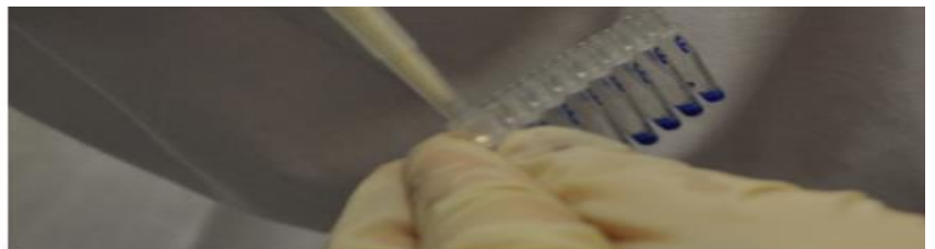
Figure 2. A student adding loading dye to her DNA samples.